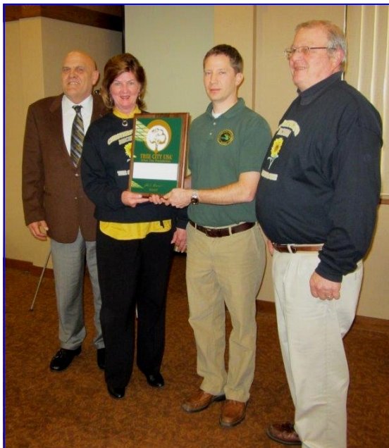
Tree City USA Plaque Acceptance

NOTE: The state tree of Michigan is White Pine